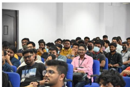
Students attending the session

Students also benefitted by the conduction various platform based, online competitive exams in coordination with Cocubes, E-Litmus Firstnaukri,