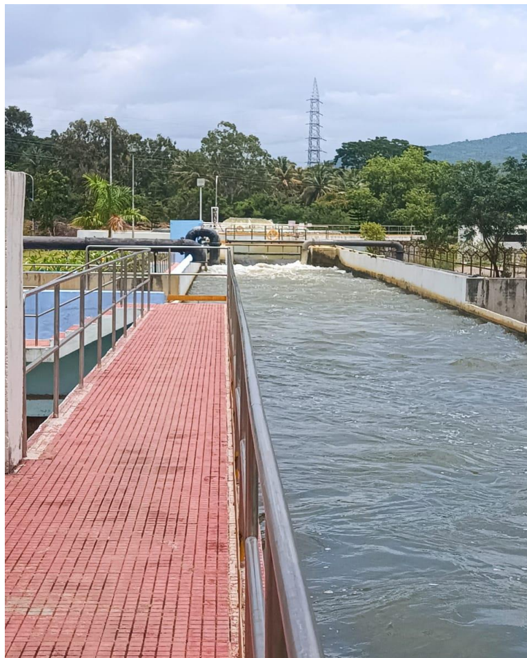
BWSSB WTP at T.K Halli on 22 nd Aug 2022.