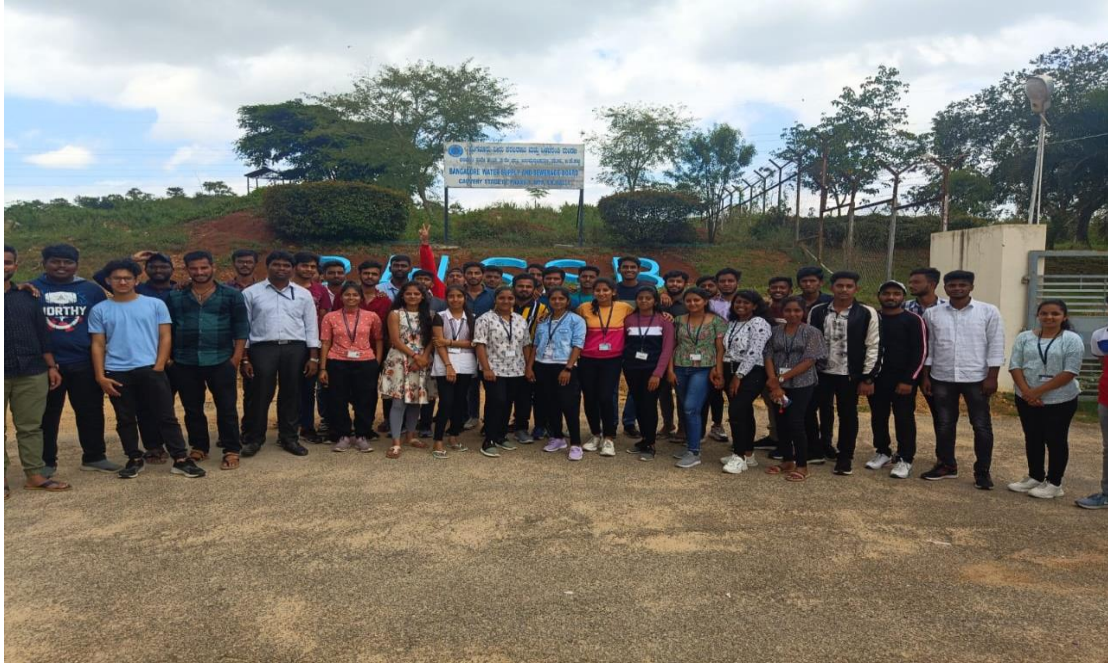
BWSSB WTP at T.K Halli on 22 nd Aug 2022 with student at Entrance.