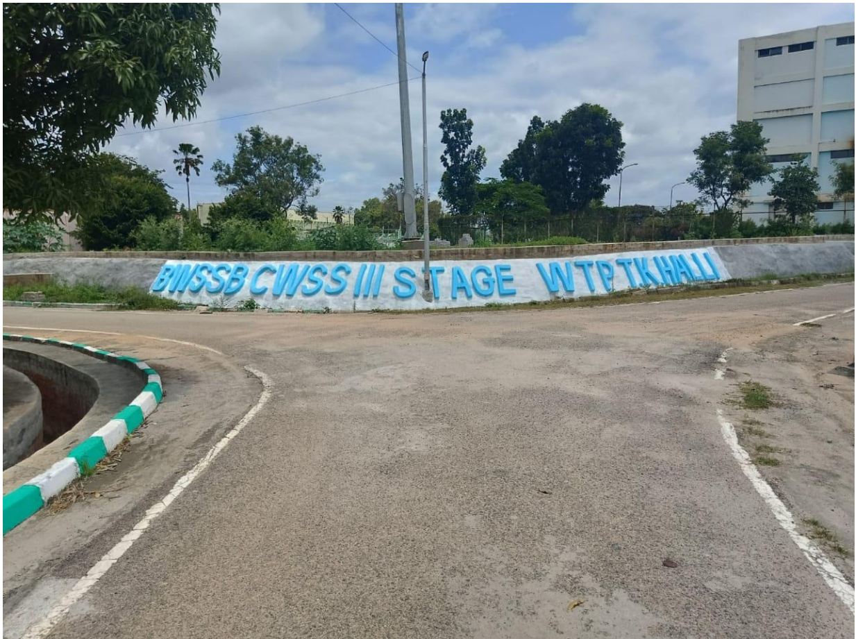
BWSSB WTP at T.K Halli on 22 nd Aug 2022.

Civil engineering department had organized a one-day technical visit to BWSSB WATER TREATMENT PLANT at T.K halli for 4 th sem students on 22 nd , Aug 2022. This visit inturn helped the students to understand an ongoing semester subject of " Water Supply and Treatment Engineering ".