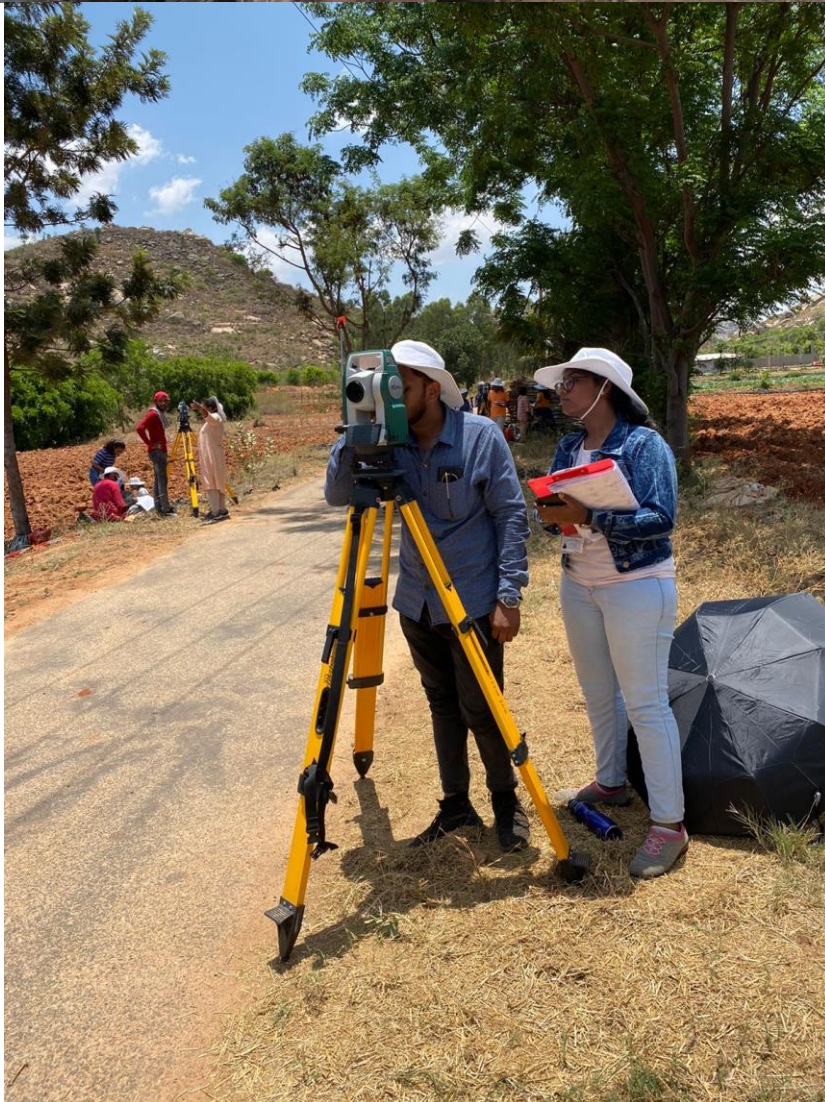
Visited Kaiwara Village from 25 th March 2022 to 10 th April 2022